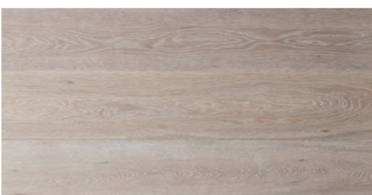
Living Brushed Danish White

Ona will give your home the perfect foundation, because the planks have soft earthy tones, which bring a sense of serenity to a busy and vibrant interior.