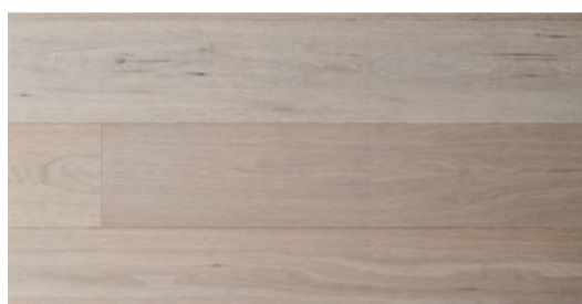
Living Brushed Greymist